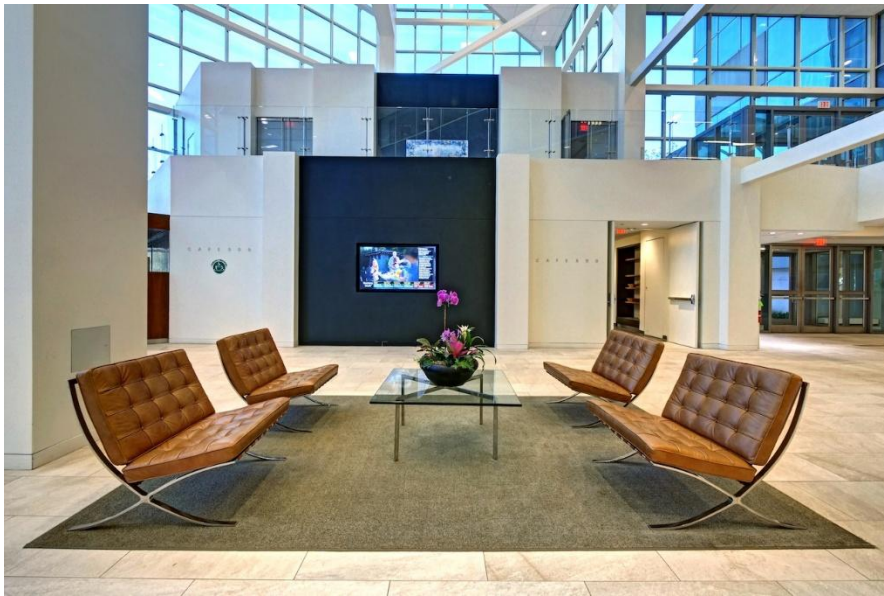
The lobby at 500 Plaza Dr., Secaucus. Signature Acquisitions

Signature Acquisitions, which acquired the 465,000-square-foot property in 2025, said the deals reflect strong demand for suburban office space near Manhattan.